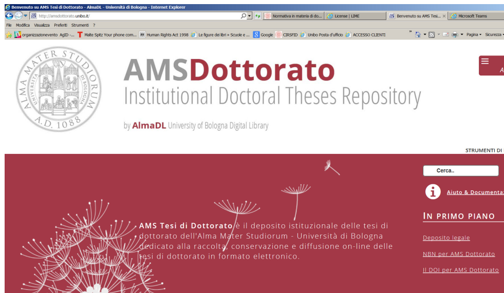
Figure 3 - PhD Thesis official open access deposit portal.

It is an official open access portal that constitutes the legal validity of the thesis deposit using the permanent link DOI (Digital Object Identifier).