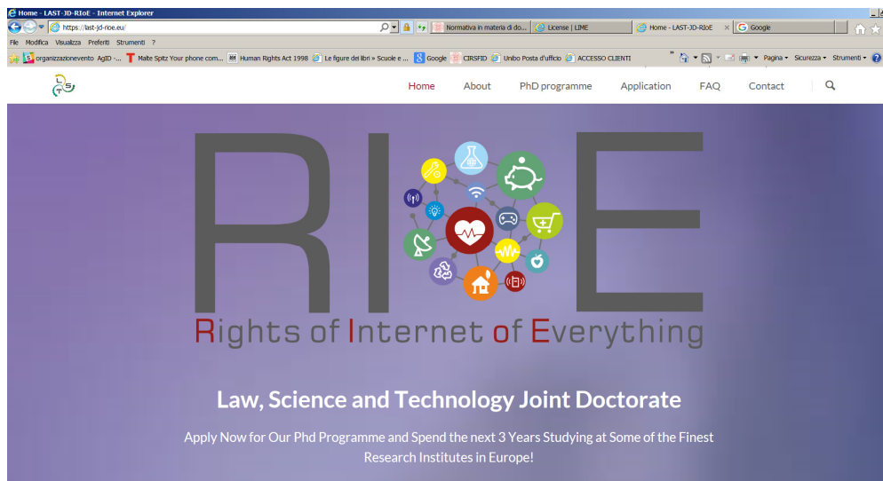
Figure 1 –General portal of the project.